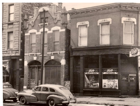
1950 (?) photo before remodeling

The Triangle is a designated historic district, a special circumstance for any architect wishing to practice within the boundaries of Old Town in respect to the preservation of existing homes and structures. One just has to look beyond the immediate Triangle boundaries and see the numerous teardowns being re-