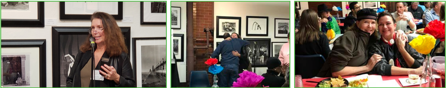
The OTTA community welcomed the 2019 Board members at the Annual Meeting and Dinner with a hearty meal and hugs all around.