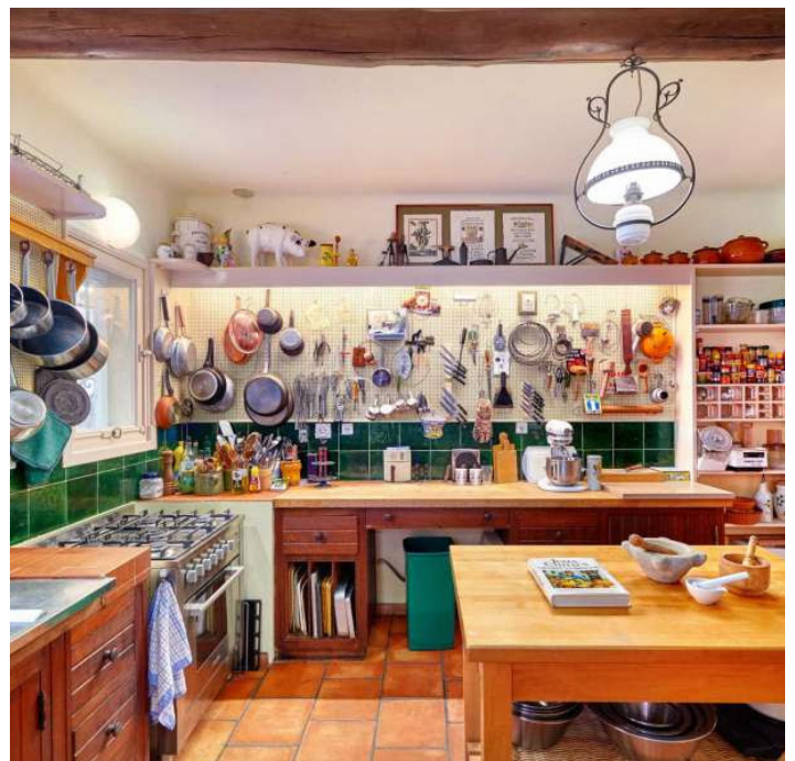
Julia Child's original kitchen in La Pitchoune today.

dined at an intimate country French restaurant in Valbonne as well as the renown 2-star Michelin, Paloma, in Mougins. One day Makenna drove us to the farmer's market in Antibes where each team of 2 was given 50 Euros to spend. White asparagus, truffles, chanterelles, baby eggplant, squash blossoms, black garlic, zebra tomatoes and freshly made green olive tapenade filled our baskets. Back to Julia's kitchen to cook our selection of produce, inventing dishes with Chef Dominee's guidance; herbed goat cheese stuffed squash blossoms in a tempura batter, roasted white asparagus with a brunoise of chanterelles, peas and green asparagus and salad nicoise prepared with only the traditional approved ingredients defined by Cercle de la Capelina d'Or, a salad nicoise police (of sorts). Our final evening Makenna Held lead us through a champagne tasting, a fitting way to celebrate what we learned and toast the freewheeling spirit of Julia.