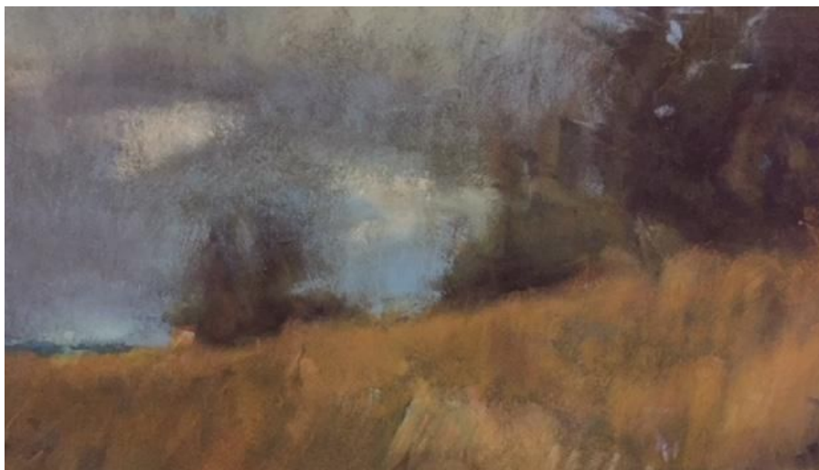
"Watervale" by Reven Fellars