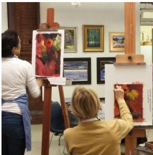
Students at work.

Exhibition: May 29 – June 28 Artist's Reception: Sunday, June 3, 2-5 pm