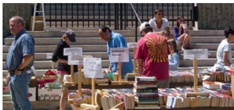
The Annual Book Sale is a great stop-along-the-way during the Old Town Art Fair Weekend.

MIDWEST BUDDHIST TEMPLE ( www.midwestbuddhisttemple.org ), is one of The Triangle's significant neighbors and good friend for more than 40 years! They are hosting their Annual Used Book Sale during the Old Town Art Fair Weekend, Saturday & Sunday, June 9th-10th, 10am-4pm . Proceeds will benefit their Homeless Projects.