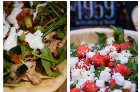
(LEFT) Harissa Jackfruit with Pickle Radish, Carrot and Olive Slaw on a Caramelized Onion Flatbread from Inspired Catering & Events (RIGHT) Watermelon Feta Salad from 1959 Kitchen & Bar (The Second City)

Chicago Doghouse: Smoked Alligator Sausage, Rattlesnake and Rabbit Sausage, Wild Boar Bratwurst, Apple Brandy Duck Sausage, Maxwell St. Polish Sausage, Chicago Style Hot Dog (Veggie Dog option)