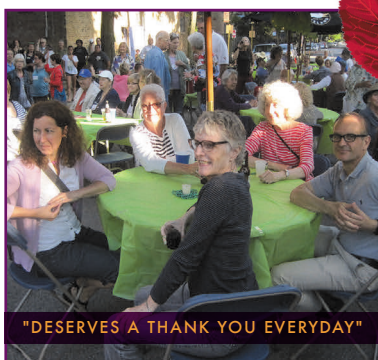
"DESERVES A THANK YOU EVERYDAY"