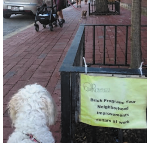
The finished project.