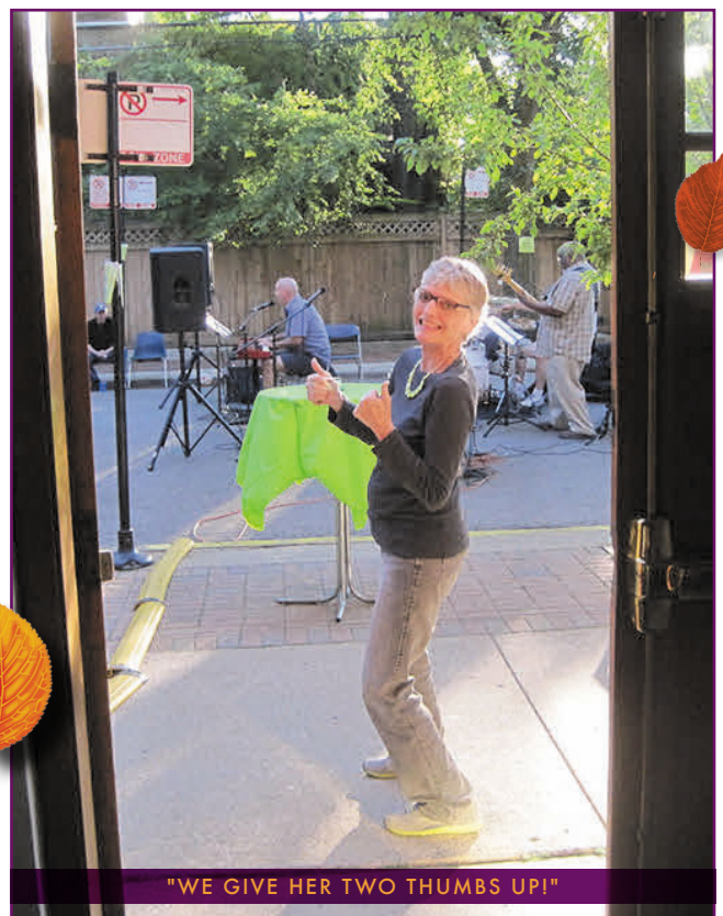
"WE GIVE HER TWO THUMBS UP!"