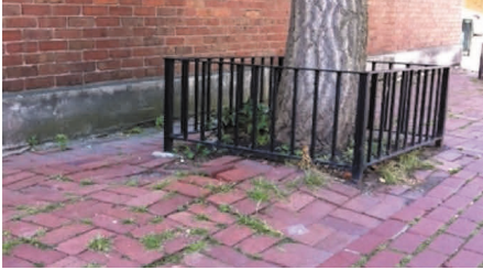
The sidewalk before the repair