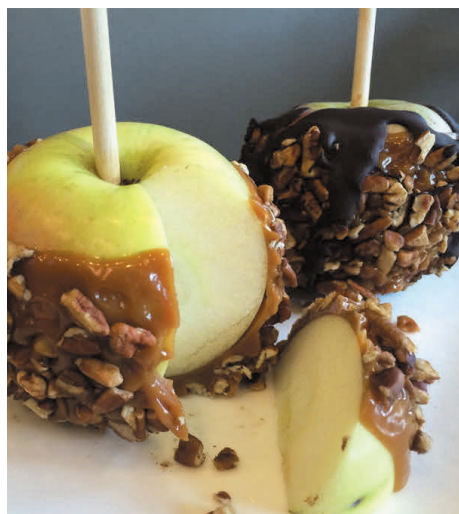
Caramel Dipped Apples with Nuts and a Chocolate Drizzled Version from Cocoa + Co.

Time to have your last sips of Cold Brew and start celebrating Fall.