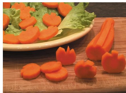
Pumpkin-Shaped Carrots and Pumpkin Patch Salad

Love caramel apples? What's not to love with these hand-dipped caramel apples using heirloom apples from Nichols Farm, coated with a rich buttery caramel and pecans,