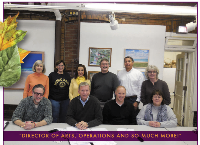
"DIRECTOR OF ARTS, OPERATIONS AND SO MUCH MORE!"