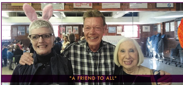
"A FRIEND TO ALL"