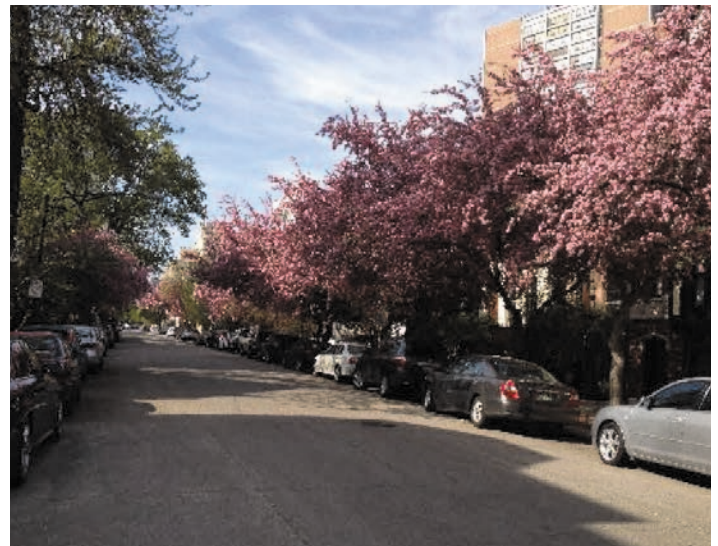
Spring in Old Town, a reminder of how important it is to save our trees.

Do you "like to stop and smell the flowers?" We are in need of more volunteers for our committee; if you are interesting in serving on this