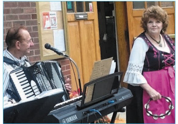
Oktoberfest was a feast with a cookie contest where no crumb was left uneaten. Oom pah pah that was fun!