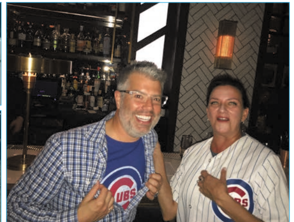
We welcomed our newest IBOT neighbor, The Kennison, and they welcomed all of us to a very Happy Hour!