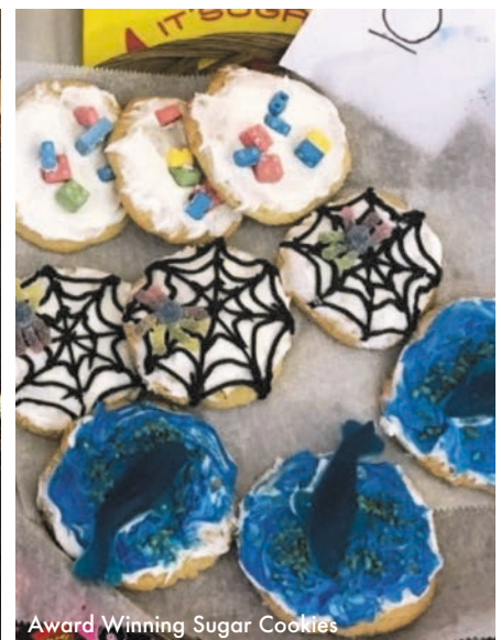
Award Winning Sugar Cookies

MARK YOUR CALENDARS FOR THE 2018 OLD TOWN ART FAIR SATURDAY, JUNE 9 & SUNDAY, JUNE 10