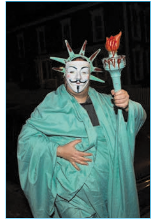
Halloween was a real treat with lots of big and little ghouls and goblins filling our streets in hopes of getting something sweet.