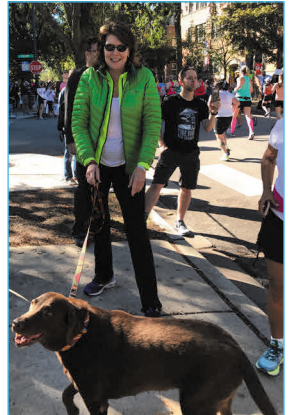
Who doesn't like to watch other people run? The 2017 Chicago Marathon was an inspiration on a beautiful day in Old Town.