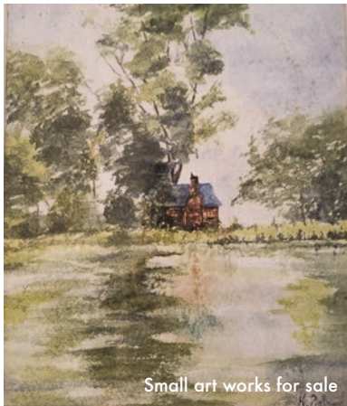
Small art works for sale