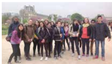
LaSalle Language Academy students at the base of the Eiffel Tower and at the entrance of The Louvre in Paris.

Our CHICAGO POLICE DEPARTMENT'S 18th DISTRICT holds CAPS Meetings (Chicago Alternative Policing Strategy) for the 10 Sector which includes Beats 1811, 1812, 1813 and 1814. These meetings are held at the Old Town Triangle Center – 1765 N. North Park Avenue – on the second Thursday of every odd month. Mark your calendars for the next meeting on THURSDAY, September 11th at 7pm. For more information, call the Precinct at 312-742-5870 or visit http://ward43.org/2012/12/18/changes-to-18th-district-caps-meetings-for-2013 .