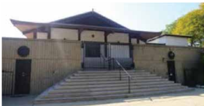
1971 The permanent home of the Midwest Buddhist Temple, located at 435 W. Menomonee at Hudson.

This year marks the 70th anniversary of The Midwest Buddhist Temple (MBT). Its story of getting and being here is fascinating.