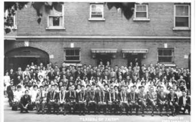
1963 The Midwest Buddhist Temple hosted the Eastern Young Buddhist League (EYBL) Convention at 1757 N. North Park Avenue, the current home of the Old Town Triangle Association.