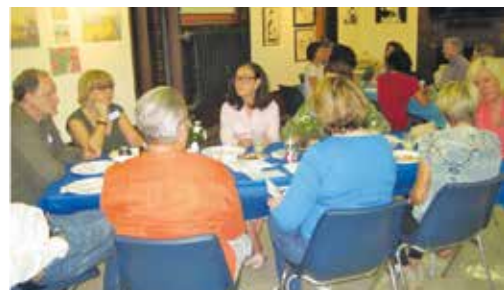
The Chicago Community Trust marked their 99th anniversary with a community-wide conversation about our collective future. The Old Town Triangle Association joined thousands of others across Chicago to generate new ideas, spark partnerships and shape a public agenda to build and sustain strong, safe and dynamic communities.