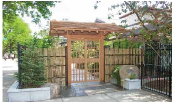
2014 The Hamano Gate at the west entrance of the newly dedicated Japanese Legacy Garden.

WRITER’S NOTES: 1) Make sure you attend The 59th Ginza Festival on August 8-9-10. Details are here www.ginzachicago.com . This is the Temple’s biggest and most important fundraising initiative of the year. In addition to helping them meet their fundraising goals, you will have a most enjoyable time of being immersed in Japanese culture – art, dance, song, food, textiles, and music. It is enchanting, “elegant” and a fun way to spend time with your family & friends. 2) The building at 1757 N. North Park was bought in 1949 for $57,500. Two apartments were used for Sunday School classes and two were residences of the ministers. The ground floor had a theatre/auditorium where services and meetings were held. The building was sold to a developer in 1975 for $350,000. ☀