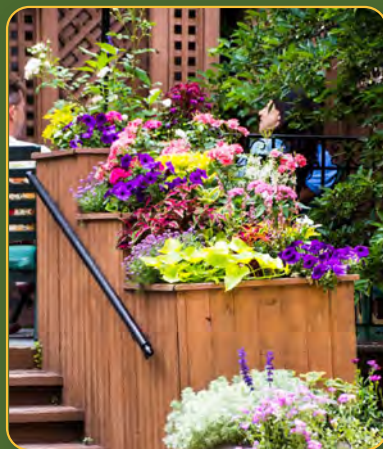
Floral Cascade 2022

Historically, Old Town sits on the "Cabbage Patch" of the 1850's and 1860's when truck gardens and cow pastures lined the land between the Clark, North and Ogden boundaries. Our gardens have come a long way since then. Thank you to all our Old Town gardeners for making out neighborhood so beautiful.