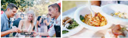
Green City Market 2022 Chef BBQ

Green City Market's Chef BBQ is September 7, 2023. In a food festival unlike any other, 100+ of Chicago's top restaurants, brewers, winemakers, and mixologists provide tasting portions of locally inspired dishes and craft beverages highlighting ingredients from Green City Market's local, sustainable farmers. Visit www.chicagochefbbq.com to be the first to know when tickets are available.