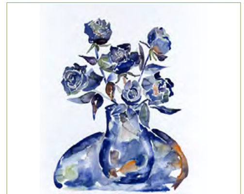
Birthday Roses (Watercolor, 1995)