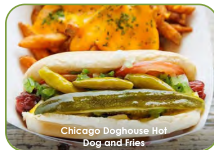
Chicago Doghouse Hot Dog and Fries

Here's a sneak preview of the vendors and some exciting new menu items and returning Fair favorites!