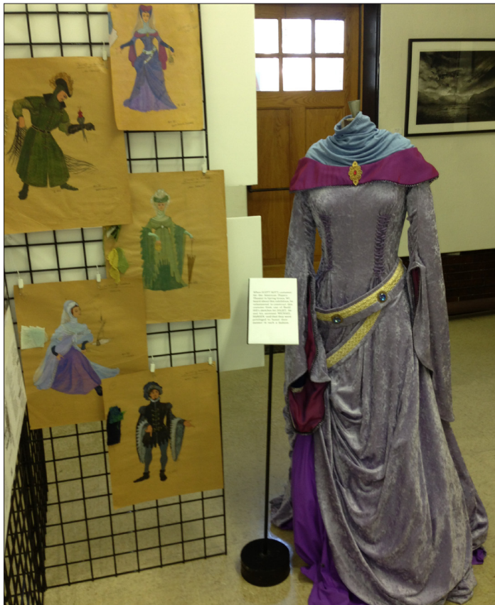
Photos and details taken of last month's pop-up display of theatrical memorabilia from the original "Old Town Players" group. In case you missed the display, please visit the Triangle office anytime to learn more about these intrepid thespians with roots in the historic Old Town Triangle neighborhood 🌟