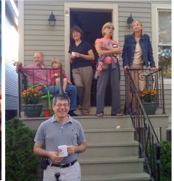
Chicago Marathon Fun on Sedgwick Street