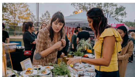
Green City Market Chef BBQ 2021.

The Chef BBQ supports sustainable farmers, helps educate our community about where food comes from and why it matters, and expands access to locally grown food.