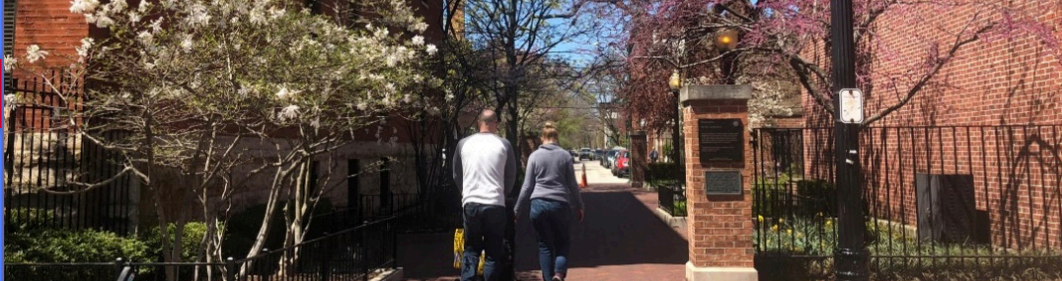
This beautiful, charming pocket park at Menomonee and Wells, called the Menomonee Pocket Park, is maintained by NIC. It becomes one of the gates to the Old Town Art Fair on June 11th-12th.