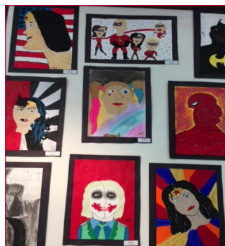
Students artwork from previous years.