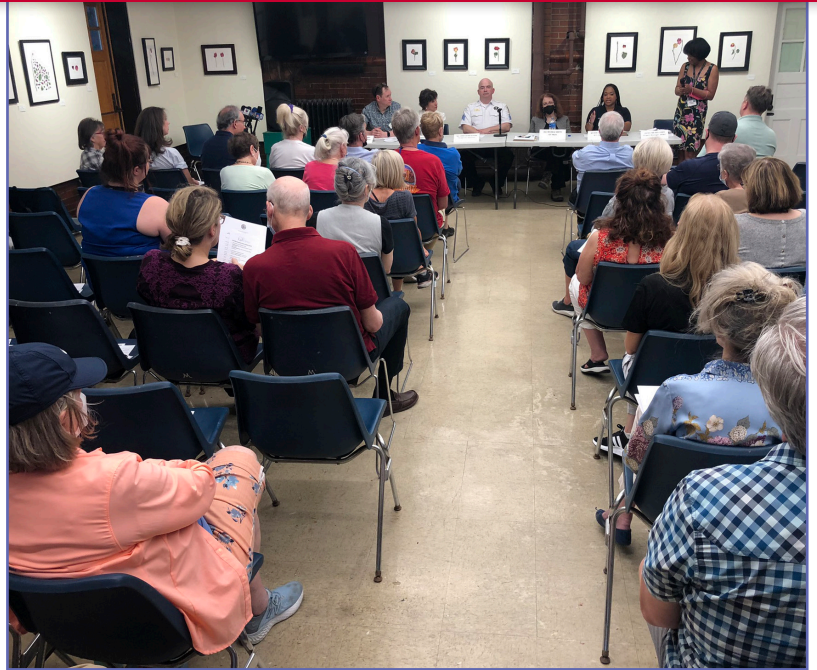
The well-attended meeting, hosted by OTTA's Community Safety Committee, recapped what the State is doing about crime and addressed neighborhood security via cameras and improved street lighting plus personal safety, especially related to car jacking

After a 2-year pause due to Covid, we're back in business with receiving grant applications from local area not-for-profits serving the young people of the neighborhood with special programs, the needs of the 55+ community, the needs of the homeless, victims of domestic violence, the hungry and other grass roots organizations. The Grants Committee is in the process of reviewing 17 applications. The Committee attempted to solicit applicants outside of our neighborhood to pursue recommended outreach to other locales. The grant awardees will be announced at the June 17th OTAF Volunteer Thank You Dinner & Grant Awards Presentation. In a typical year and since the founding of the Old Town Triangle Association in 1948, the Grants Committee awards funding to neighborhood not-for-profits.