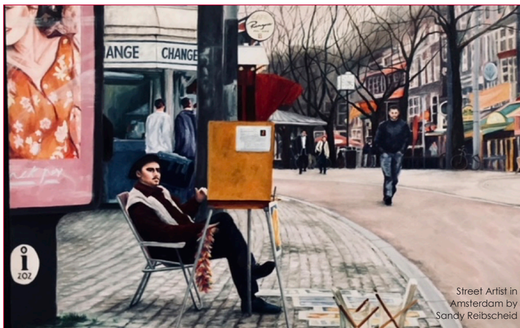
Street Artist in Amsterdam by Sandy Reibschied