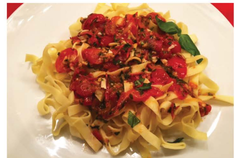
Patti's Fresh Tomato Sauce

Old Town Triangle neighbor, Patti Lovinelli, has been making her Italian family recipe for Patti's Fresh Tomato Sauce for years. "In 15-20 minutes and only 5 ingredients- cherry tomatoes, garlic, basil, olive oil, salt and pepper- you'll have the best fresh sauce without heating up your kitchen". Patti doesn't