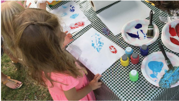
Club Sprouts have fun print-making