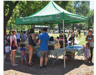
Club Sprouts tent at Green City Market

So what is kohlrabi? Who knew cauliflower could be yellow or purple as well as white? Kids know the darndest things nowadays. Learn more at www.greencitymarket.org .