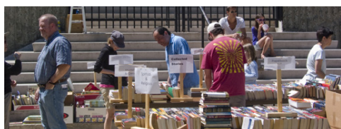
The Annual Book Sale proceeds will be sent to the Midwest Buddhist Temple's temple in Nepal.

The MIDWEST BUDDHIST TEMPLE ( www.midwestbuddhisttemple.org ) is hosting its Annual Book Sale during the Old Town Art Fair weekend, Saturday & Sunday, June 13th-14th. Proceeds will benefit the earthquake relief in Nepal.