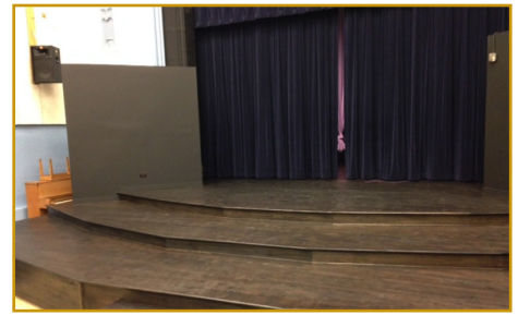
Franklin Fine Arts Center renovated stage, funded, in part, by a $5,000 grant from the OTTA.

Franklin is the fifth oldest school in Chicago. The actual building that exists today was built in 1979 and named Franklin Fine Arts Center, for the sole purpose of integration and commitment to the arts. For almost 30 years, students have explored, created,