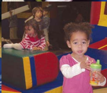
bouncing, balloons, acrobatics