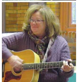
rompin' stompin' voices and strings