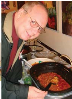
the chili line and . . . accompaniments