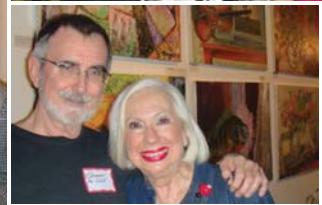
food fun families, friends, neighbors