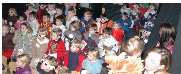
Halloween Party at Sedgwick Productions - Charlie Brown Great Pumpkin with 3D Glasses.

in my production studio for a movie, to watch the Charlie Brown Great Pumpkin. There was the Block Party with pony rides, and the children were invited to sit in extraordinary imported vintage mini automobiles