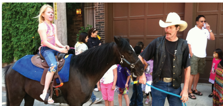
Block Party featuring Pony Rides.

Other events followed: We celebrated the neighbor who was interested enough in beautifying the street by asking the mayor for help with the massive clean-up of the "spaghetti" of phone, power, and cable TV lines identifying Fern Court as an alley (after years of trying the regular channels). A Halloween Party of 30 kids wearing 3D glasses showed up