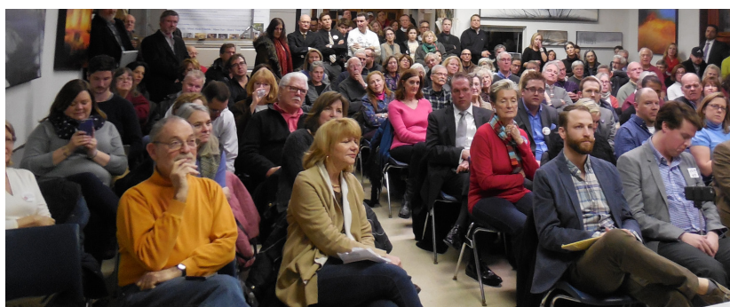
Standing Room Only at the January 29 "Meet the Candidates"

We are making plans for our spring event, so watch for an announcement soon! Some neighbors have started to identify events they want to see, such as kid-friendly activities, so if you have an idea, let us know! We would love to connect you with neighbors and bring events to OTTA. 🌸