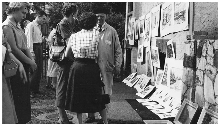
A 66-year tradition, the Triangle welcomes artists, neighbors and thousands of visitors to our nationally recognized, outdoor, juried art fair!

While fun is always on the OTAF's agenda, it's important to note how critical the Fair is to the caretaking of our neighborhood and the programs and organizations that the Old Town Triangle Association serves and supports. Fair revenues are the single largest contributor to our Association – so please, support this year's fair in any way you can!