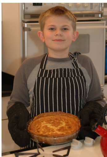
Chess Pie by Carlton Christian

Spring brings a renewal of fresh ideas, awakening our senses and palate to new fresh flavors and foods. Research tells us people are snacking more with 91% of adults snacking once a day and increasingly eating snack foods along with their main meals. Traditional mealtimes of 3 meals a day are on the decline with healthier snacking throughout the day as the new meal norm blurring boundaries between meals and snacks. Trending snacks have health attributes and feel good nutrition, like probiotics and protein rich snacks. What's hot? Posh jerky, pea protein, chickpeas, high-class popcorn, brogurt, mini-portions, veggies, beans, chia and even insects and bars made with cricket flour (CHIRP!), according to FoodNavigator-USA. The "snackification" of breakfast with healthy snacks filling the gap are replacing conventional breakfast foods; muesli bites, waffle bars in portable pouches, Belvita biscuits.