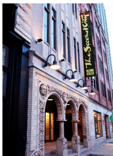
The Second City is located at 1616 N. Wells Street, its second home on Wells Street since its founding in 1950.

Second City also boasts an exclusive arrangement with Norwegian Cruise Line, providing improv comedy to 14,000 happy passengers per week across the fleet's ships.