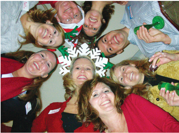
The Fern Court Gang at one of the Annual Progressive Holiday Parties.

coming from the "museum" in the garage next door.