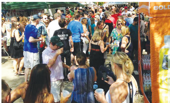
Nothing says "Hello Summer" more than the Old Town Art Fair, which jumpstarts Chicago's summer festival season in sunny style!