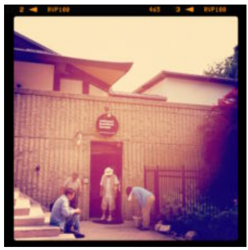
(Midwest Bubbhist Temple)

THE MIDWEST BUDDHIST TEMPLE (www. midwestbuddhisttemple. org), a good neighbor since 1948, will have their 4th Annual Used Book Sale in front of the Temple at Menomonee Street on June 9th & 10th during the OTAF. Proceeds from the sale go to community outreach programs. They are collecting used books