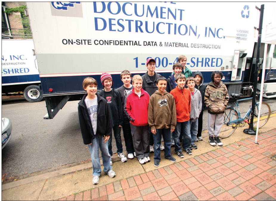
Members of Boy Scout 79 helped out in the shredding

Just a note, the Shed and Shred Event, a community wide yard sale and shredding event has been scheduled for July 14 . The event will be much the same as last year, with a shredding truck parked in front of the Triangle Center on North Park, to be replaced by a Salvation Army truck later in the day to take away unsold items. La-Salle Academy will hold a French market on their playground. The Midwest Buddhist Temple will also participate, and is selling tables for $50 apiece to those who want to participate with them. Church of the Three Crosses will participate, as will several condo associations in the area. The Triangle, once again, will have tables for those who don't have sidewalk room. First come, first serve for association members.