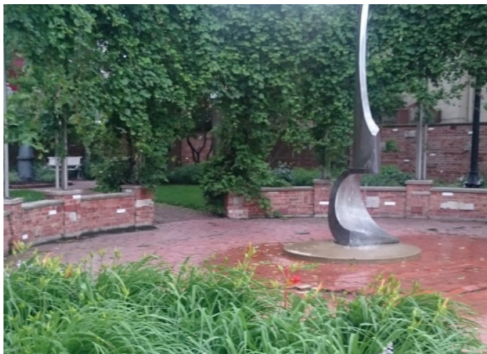
Triangle Park at the corner of Clark and Wisconsin offers a calm and peaceful area to sit on a summer day.

Lastly, NIC intends to investigate the cost of putting old fashioned light poles in our area to match those that are already on certain streets in the Triangle.